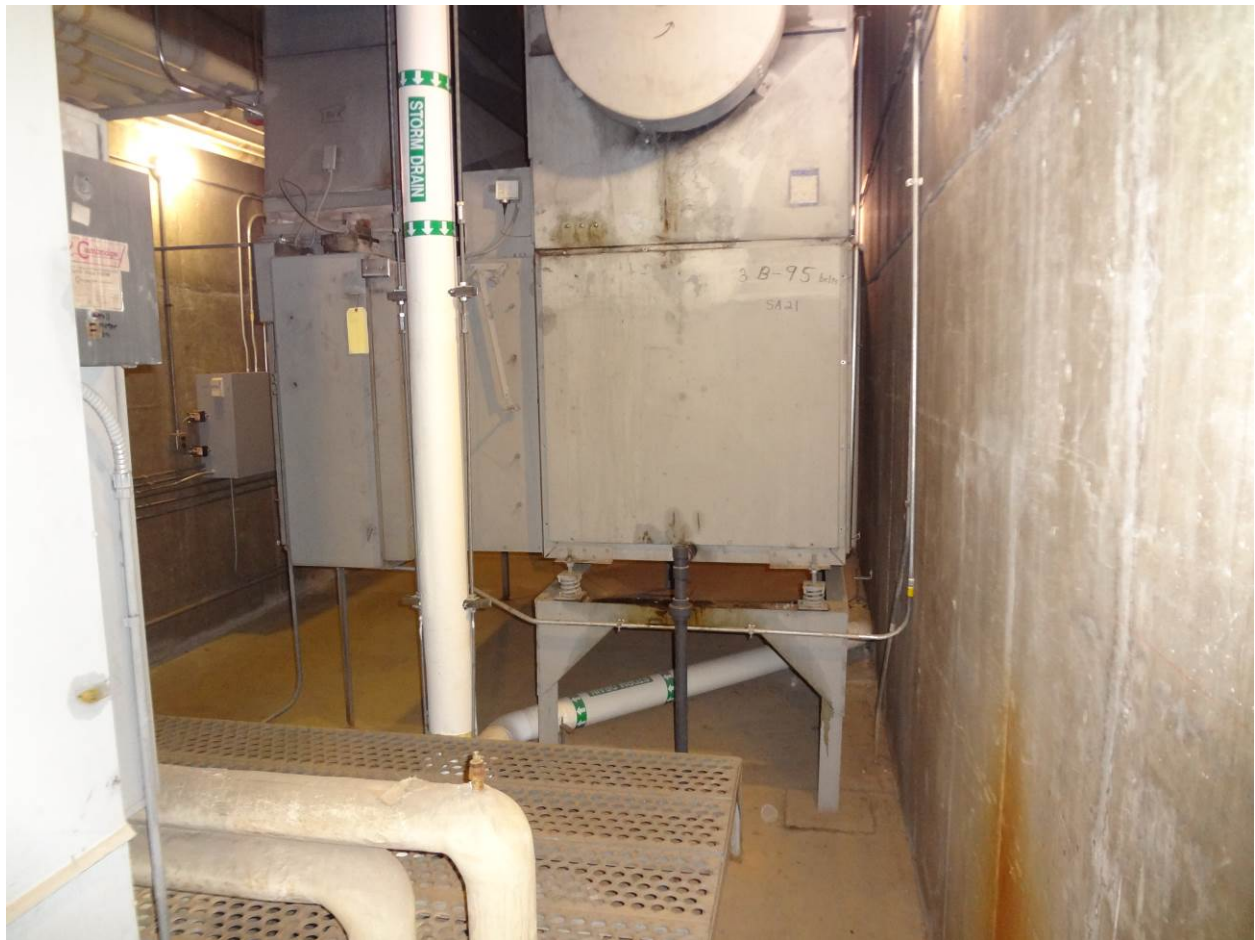
Figure 4 - Example of Existing Mechanical Pod