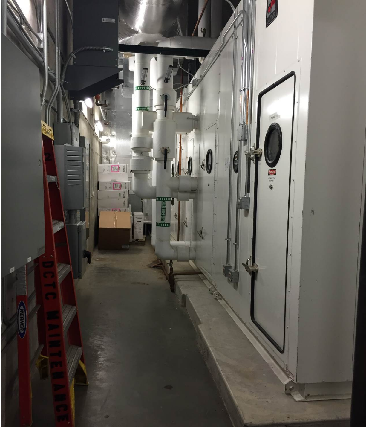
Figure 5 - Example of New Mechanical Pod